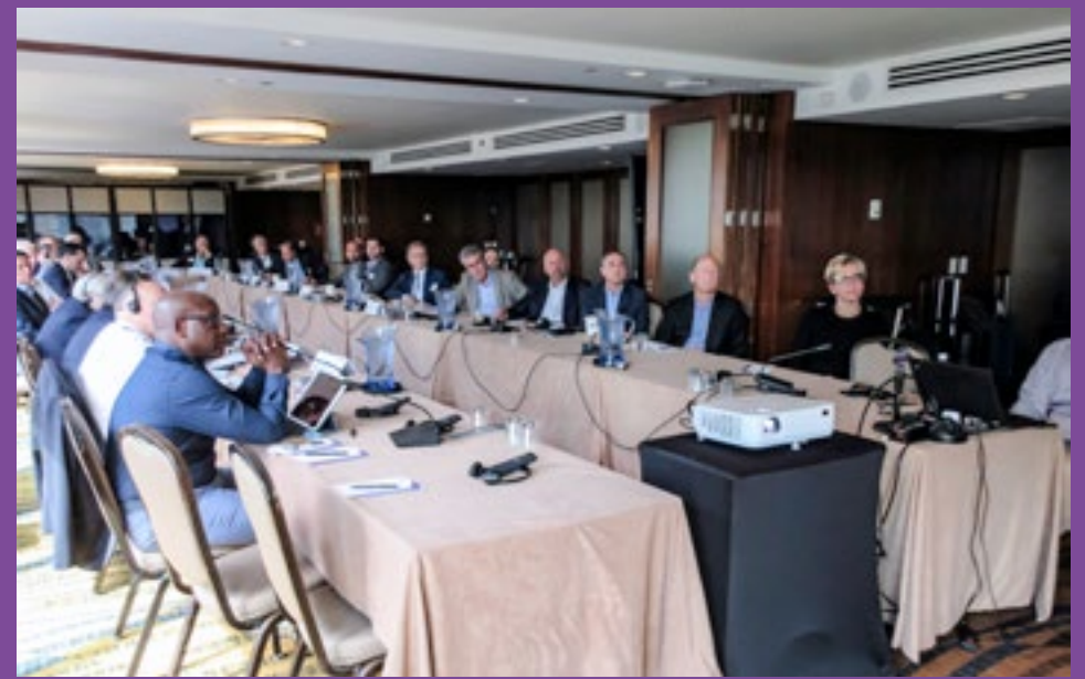
Presentation of IM Supply (IMARK member)